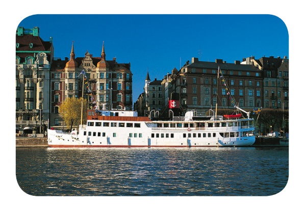
Thursday August 20 you are inivited to a dinner cruise aboard M/S Waxholm III.